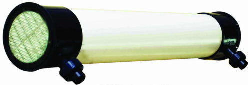
PCR Membrane Module

TFT has a professional management and technical team with skilled experience of many years and hundreds of references on membrane technology. Working closely with partners, we endeavor to offer you special and professional technical service and support, like evaluation, design, installation and commission. We are willing to share and cooperate with you on efficient and integrated membrane technology for separation, purification, dehydration & concentration.